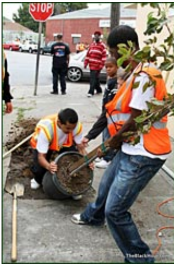
Greening the West Tree Planting

"A people without the knowledge of their past history, origin and culture is like a tree without roots."